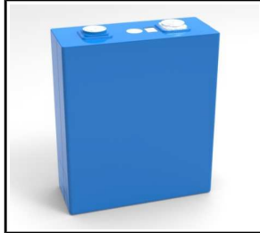
Dimension (excluding terminals)