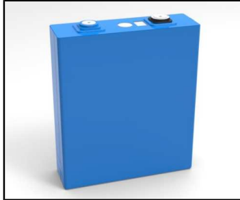
Dimension (excluding terminals)